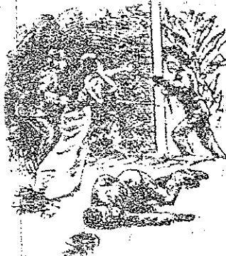
"ONLY THE GLITTERING FLASH OF A PIECE OF STEEL AND HIS MOANING CRY OF THE DYING OFFICER."

"I was only interested in the case in a business way then, for I was working on it for weeks in a lawyer's office in Honolulu; but when the particulars